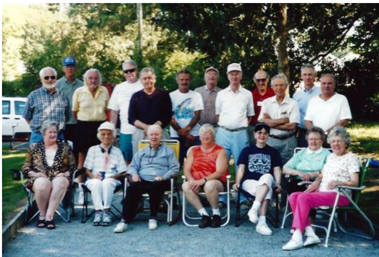
A group of players at the Hendersonville courts for an invitational event.