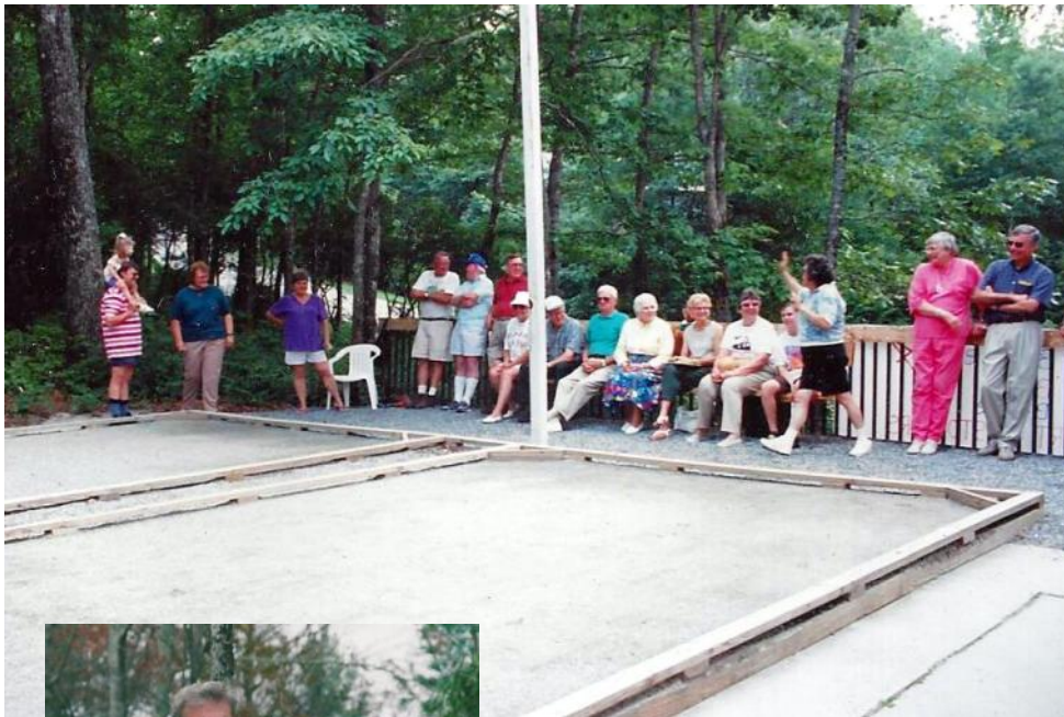
A good crowd at the courts